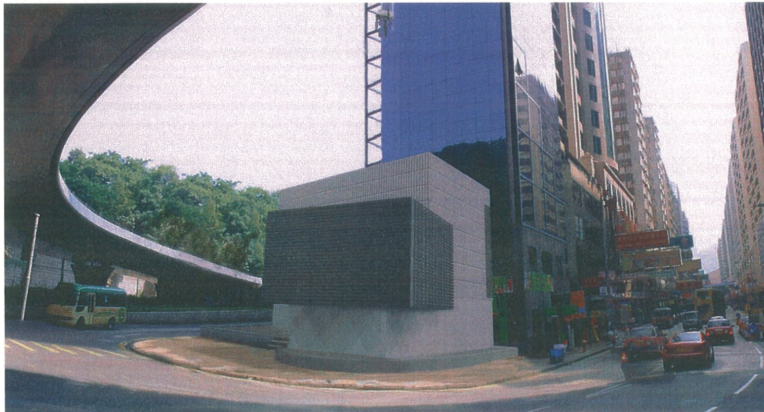
DAY 1 WITHOUT MITIGATION