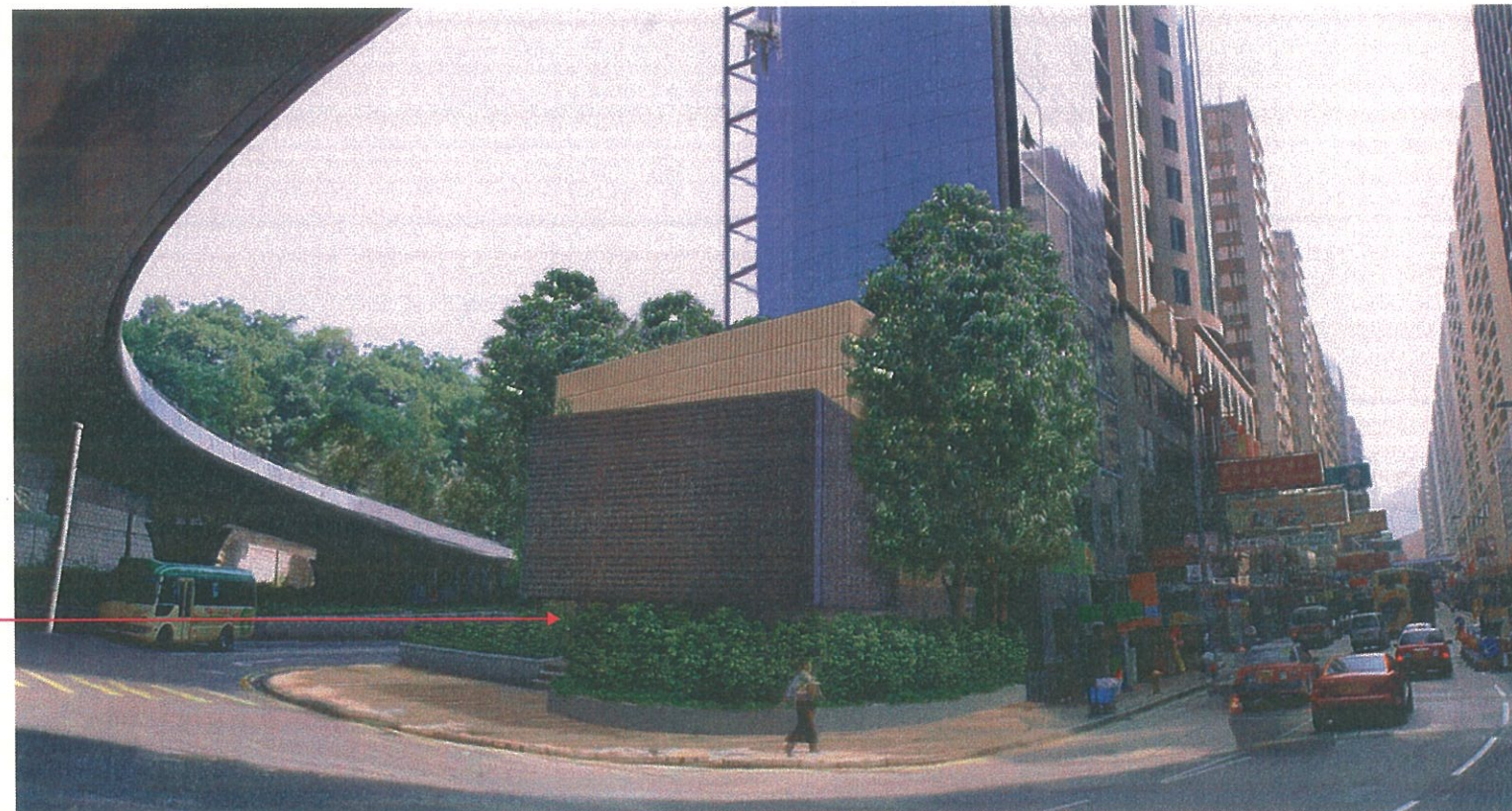
YEAR 10 WITH MITIGATION

OM12 - Trees, tall shrubs and climbing plants to be planted against face of Canton Road Plant Building so as to soften building facade.